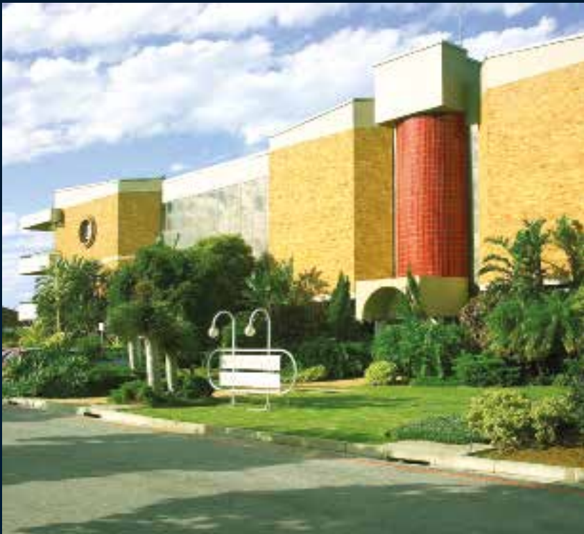
Summerstrand North Campus