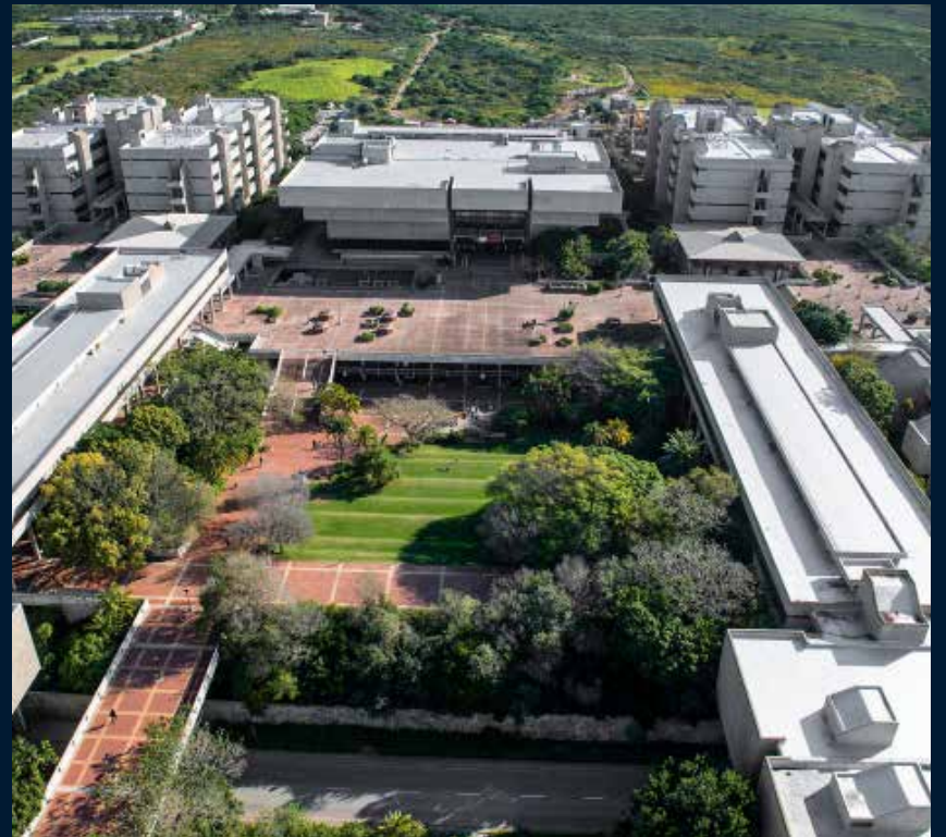
Summerstrand South Campus