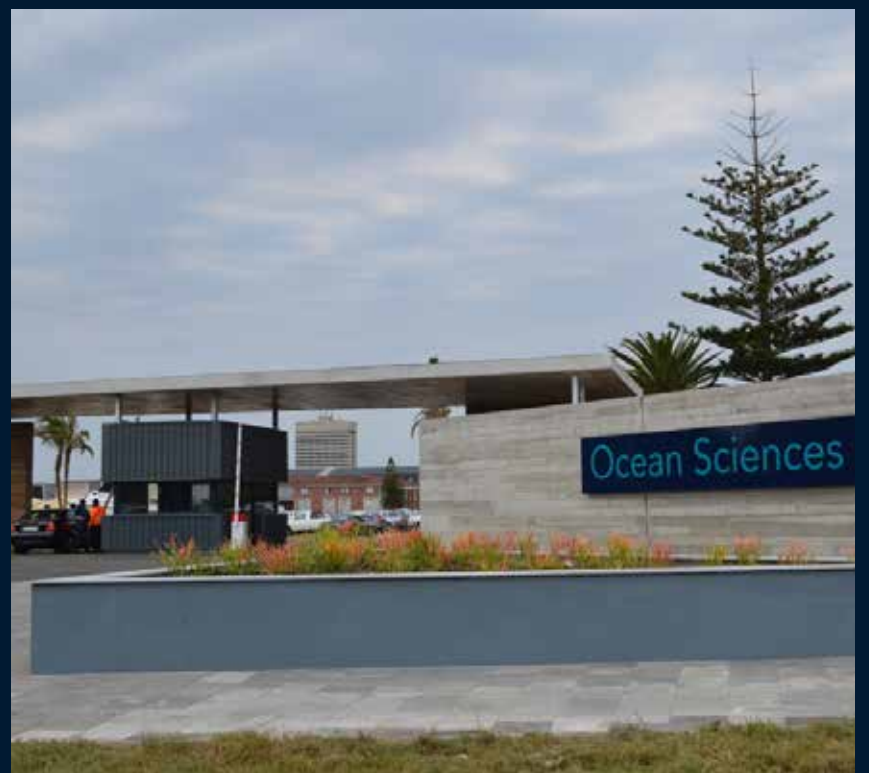
Ocean Science Campus