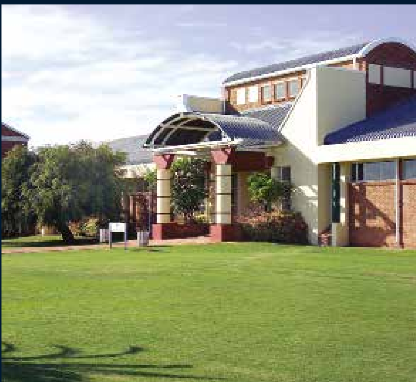
Second Avenue Campus